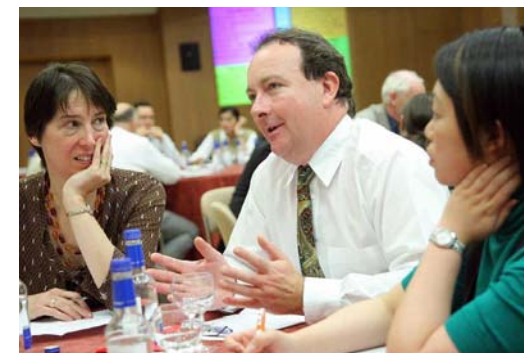
Participants debate the issues at the meeting

The formal Board meeting was held the following day on Wednesday 14 September, with discussion concentrating upon governance issues relating to the new election scheme, LPFs, Pharmacy IT and bar coding, the future role of the Transitional Working Group and the programme for change ■