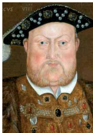
Royal College of Physicians of London

of Physicians in 1518? Or that his personal interest with medicine was partly because he was obsessed with the terror of dying without a male heir? Find out more at the event including: