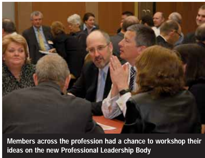
Members across the profession had a chance to workshop their ideas on the new Professional Leadership Body

"You're in the castle and the drawbridge is down. It's up to you to make this work."